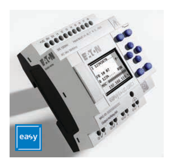
easyE4 reflects the optimum solution for simple control tasks in industrial or building applications.

The easyE4 control relay supports you efficiently in various control projects. Thanks to the high number of inputs/outputs and the large voltage range, the easyE4 is ideally suited to industrial and building applications. In combination with the interrupt function, the powerful processor enables faster processing and response times during operation.